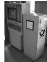
Mail box and vending machine