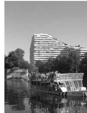
Boat Trip on the Danube river