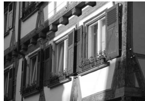
Historic Part of Ulm