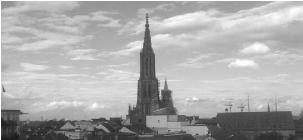
With its 161m, the Ulm Münster has the world's highest church steeple.

The Danube river and the Swabian Alb with many touristic destinations are located close to Ulm and Neu-Ulm. From the steeple of the Ulm minster, you have a breathtaking view of the twin cities, in clear weather actually stretching to the Alps. These mountains are the ideal place for skiing and snowboarding in winter time. Both the Alps and Lake Constance are only a one-hour car-ride away. Bigger cities with airports, like Munich and Stuttgart, are reachable within the same time.