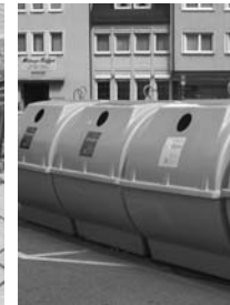
Glas containers in Ulm