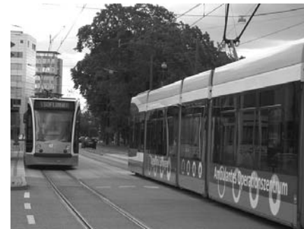
Tram in Ulm

The semester ticket is valid within the whole DING area for the duration of a full semester. The price is 93,00 € per semester. All registered students of Ulm University, Ulm University of Applied Sciences and the University of Applied Sciences Neu-Ulm are entitled to buy it. If you register in Ulm for the first time, you will get one free Semester Ticket from the city.