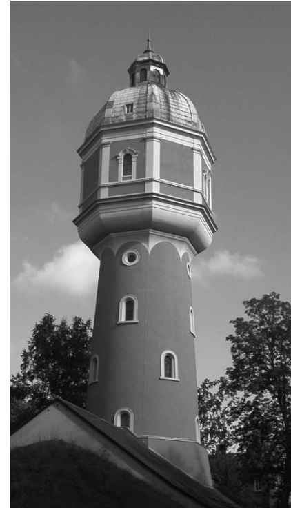
Landmark of Neu-Ulm, the Wasserturm (water tower).