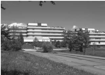
Southern part of Ulm University