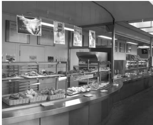
Cafeteria of the Studentenwerk at Ulm University

It manages the cafeterias, student restaurants (Mensa) as well as numerous student residences in Ulm and Neu-Ulm. In addition, it runs a kindergarten for students' children. All enrolled students have to pay a semester fee as a contribution to the funding of these services.