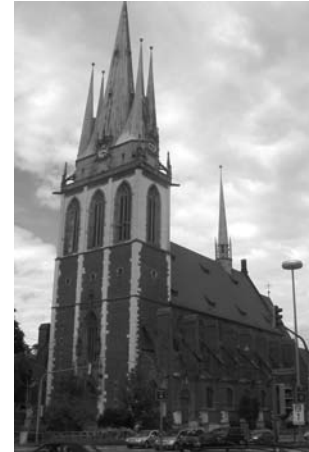
Church St. Georg, Ulm Oststadt