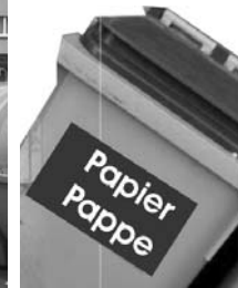
Blaue Tonne in Ulm