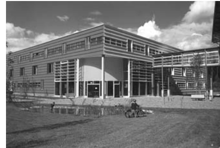
Main library of Ulm university

Bibliothekszentrale Universitaet-West Albert-Einstein-Allee 37, 89081 Ulm ☎ +49 (0)731 / 50-15544 www.uni-ulm.de/einrichtungen/kiz/bibliothek.html Opening hours: Mon - Fri: 8.00 a.m. - 10.00 p.m. Sat: 10.00 a.m. - 8.00 p.m.