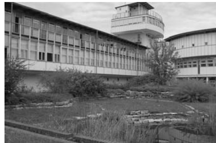
Western part of Ulm University