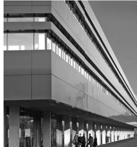
University of Applied Sciences Neu-Ulm

Opening hours: Mon – Thu: 09.00 a.m. - 7.00 p.m. Fri: 09.00 a.m. - 5.00 p.m Every second Saturday: 10.00 a.m. - 2.00 p.m.