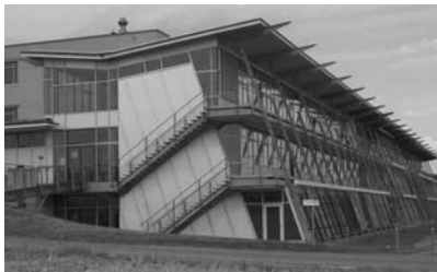
Location Oberer Eselsberg