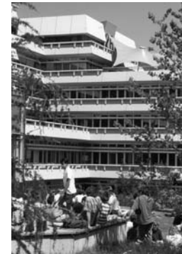
Southern entrance of Ulm university