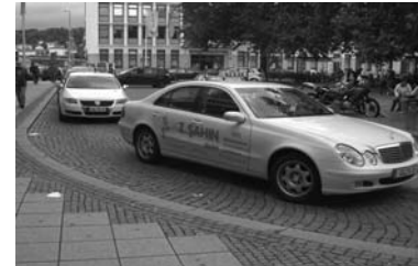
Taxis at the main station in Ulm

☎ Taxizentrale Neu-Ulm: +49 (0)731/77000 or +49 (0)731/75000