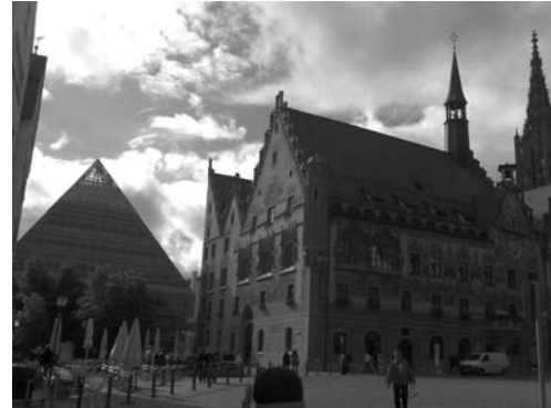
Library and town hall

Besides cinemas, theatres and museums, Ulm and Neu-Ulm offer a broad range of leisure activities: rowing, boat trips and ice-skating are very popular. In summer, quarry lakes in the city surroundings invite for a swim. In that season, Ulmer Zelt (Ulm Tent) stands for a varied entertainment programme with political cabaret, comedy, rock and jazz. The open air concerts on the Münsterplatz have become famous for their live acts during the Oath Week. Afterwards, you can explore the many bars and clubs to turn night into day.