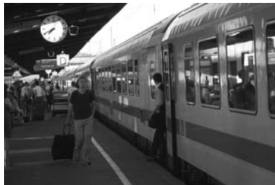
Arriving at Ulm main station (Hauptbahnhof)

You find more information on these topics in chapter 4 and 5 of this brochure. The International Office of your university can give important advice concerning all formalities you have to handle at the beginning of your studies in Ulm/Neu-Ulm. Furthermore, you can get valuable hints about living and studying in Ulm/Neu-Ulm that may help you to feel comfortable soon. Therefore you should make use of all the information and orientation offerings by your International Office upon arrival at your university city.