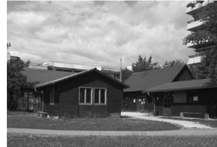
Musisches Zentrum, Ulm University