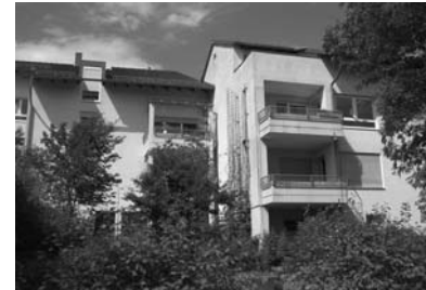
Student Residence Kelternweg

There are several student residences in Ulm and Neu-Ulm run by Studentenwerk Ulm and other organizations. Rooms must always be rented for at least one whole semester (6 months). There are bus connections from all student residences to all universities and to the city centre.