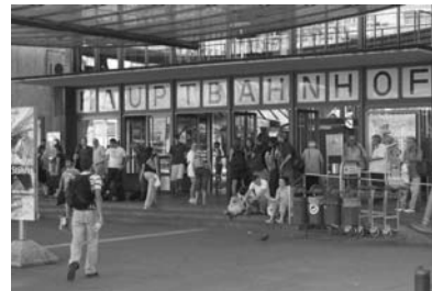
Main entrance of Ulm main station