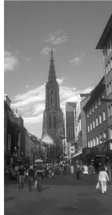
Pedestrian area, Ulm

You will find a farmer's market in Ulm on the Münsterplatz and at the Petrusplatz in Neu-Ulm, where farmers from the surrounding region offer fresh vegetables, fruits and other food (both on Wednesdays and Saturdays from 7 a.m. to 1 p.m.).