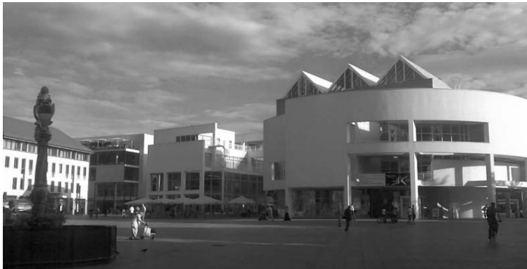
The Stadthaus at the Münsterplatz, a postmodern building close to the gothic minster.

With a total of 170.000 inhabitants, the swabian twin cities are manageable. Everything is close and will seem familiar in no time. The Danube river officially divides the two federal states Baden-Württemberg and Bavaria. Ulm, the bigger of the two cities with 120.000 inhabitants, is located in Baden-Württemberg and directly borders the smaller Bavarian city of Neu-Ulm on the other side of the Danube river. The two municipal authorities work hand in hand in many sectors. They have grown into a comprehensive economic and cultural space and form the centre of the region between Allgäu and the Swabian Alb.