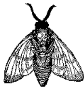
Abbildung 2: A sample black and white graphic (.eps and .pdf format) that has been resized with the \includegraphics command.

As was the case with tables, you may want a figure that spans two columns. To do this, and still to ensure proper “floating” placement of tables, use the environment figure* to enclose the figure and its caption. and don’t forget to end the environment with figure* , not figure !