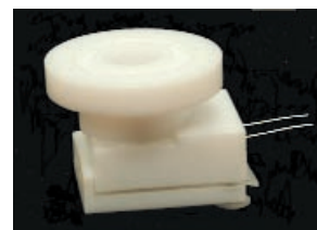
QA-CL4 Well Cell Resonator Holder