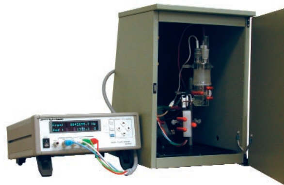
QCA922 with Sherbrooke Cell

The QCA922 comes calibrated to operate with 9MHz AT-cut quartz crystal resonators 1 . This frequency range is sufficient to provide ng level measurements 2 while still working with a crystal thickness that is not extremely fragile. The frequency resolution is 0.1 Hz at a sampling rate of 100 ms, allowing for excellent sensitivity down into the ng region. Sensitivity is based not only on the resolution and stability of the instrument, but also on the application and experimental design (i.e., proper shielding). For instance, the QCA922 includes a crystal holder that is extremely flexible in application use. It can be used as a well cell (0.5 mL volume), a dip cell into a larger beaker, mated to a larger cell, or incorporated into a flow-through system of users design. However, for the most sensitive measurements, we have the optional Sherbrooke Cell (part # 233067), which was designed to operate with the system as a nano-balance for the greatest level of sensitivity.