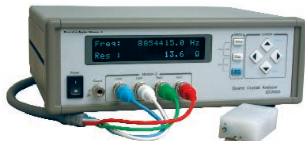
QCA922 Main Body, Cable, and Au Resonator

Princeton Applied Research is proud to offer the QCA922 Quartz Crystal Analyzer. The QCA922, an instrument developed for piezoelectric gravimetry in the ng- \mu g regions, monitors both the resonant frequency and resonant resistance of a Pt or Au coated AT-cut quartz crystal. The resonant frequency changes with the effective surface mass on the crystal, and the resonant resistance changes with the viscosity of the material interfacing with the surface of the quartz crystal. Capable of covering a wide range of applications, the QCA922 was developed primarily for applications where it is used in conjunction with a potentiostat/galvanostat as an Electrochemical Quartz Crystal Microbalance (EQCM).