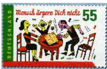
Currently released stamp „Mensch ärgere Dich nicht“