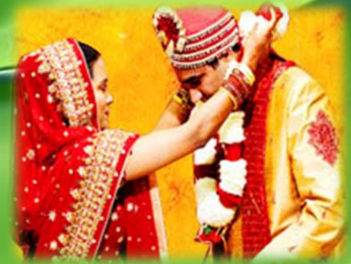
Customs of : "INDIAN WEDDING"