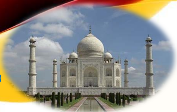
Crown of Palaces : "TAJ MAHAL"