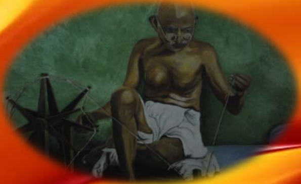
Father of Nation: "GANDHI JI"