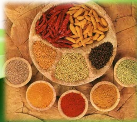
Taste of India : "SPICES"