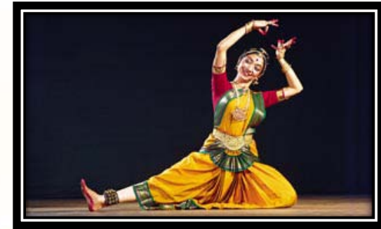
Classical dance: "BHARATA NATYAM"