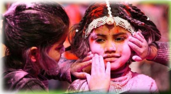
The Festival of colors : "HOLI"