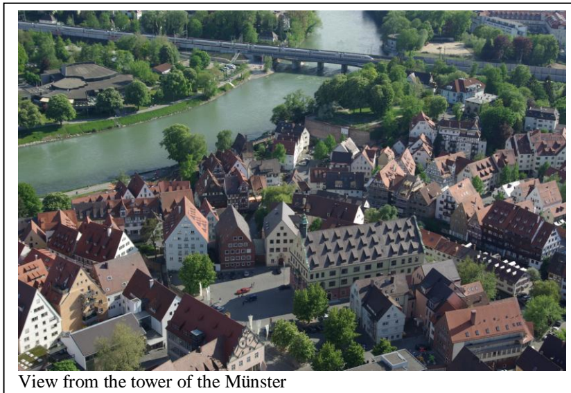
View from the tower of the Münster