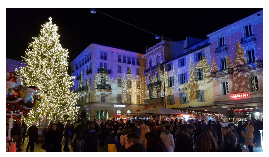
Christmas market in the centre of Lugano