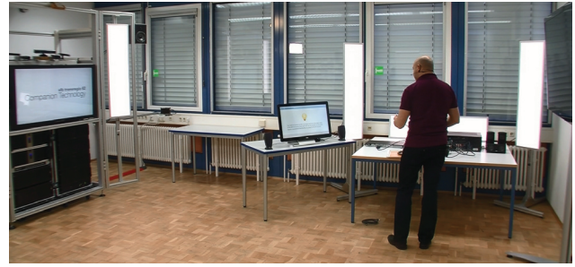
Figure 2. Based on the user's position, the user interface is rendered on the screen in front of the user.

As described earlier, adaptation to changes in the context of use can be applied on the levels of the abstract, concrete and final user interfaces. The CUI as well as the FUI are instantly adapted in cause of the fission's modality