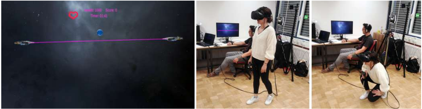
Figure 2: Lasers (only visible to the non-HMD player) spawned at roughly HMD height, at a distance of 50m from the grid (distance marked by Earth object as a reference point). The HMD player ducked based on the non-HMD player’s instructions on timing.

The non-VR player ( non-HMD player ) watches the HMD player’s view of the game world via a PC monitor, but has additional information—that is not visible in VR—overlaid on top of this on the monitor display. This player’s view includes traps (i.e., the orange-coloured grid cells in Figure 1b), the remaining time (see Figure 1c,d), and they are able to see and hear incoming lasers. They are also able to see uncovered images in the memory puzzle (see Figure 1d).