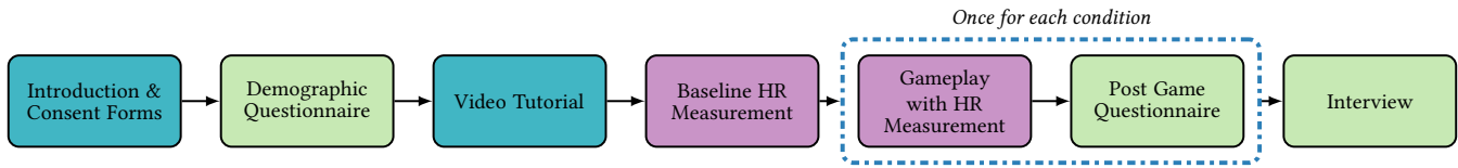
Figure 4: The study procedure followed a mixed-design and assessed psychometric, physiological, and interview data. For a subset of 14 participants, we conducted an interview on their experience of the different game variants.

dominant . For immersion, we employed the Immersive Experience Questionnaire (IEQ) [43], which consists of the subfactors real-world dissociation, challenge, control, emotional and cognitive involvement (7-point Likert scales: 1= not at all ; 7= a lot ) 5 as well as a single-item measure of immersion (10-point scale of same direction). A presence rating was acquired via the Slater-Usoh-Steed Questionnaire (SUS) [82]; the questionnaire consists of 6 items on a 7-point Likert scale (1= not at all ; 7= very much so ). We also employed a custom single-item measure of enjoyment (“ I enjoyed the experience in this condition ”) on a 7-point Likert scale (1= not at all ; 7= very much so ).