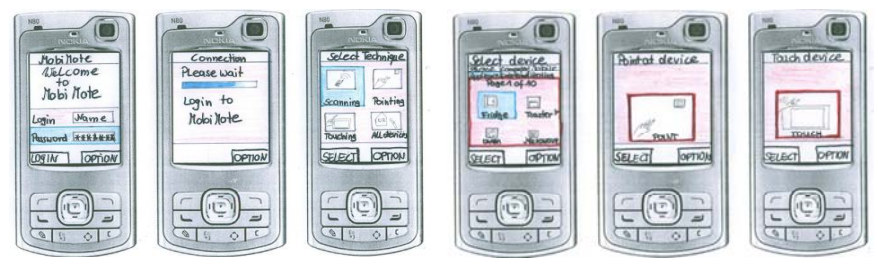
Fig.2. Paper prototype

The second phase of the user centred design process was to create a low fidelity prototype of the application and to conduct a paper prototyping test. Figure 2 shows some examples of the used paper prototype. The test was conducted by eight people who performed two tasks to verify assumptions in the analysis phase.