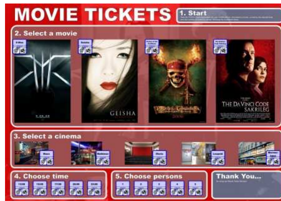
Figure 2: Augmented poster for movie ticketing

The second poster allows users to purchase movie tickets and includes appropriate options (movie title, cinema name, number of tickets and preferred timeslots) together with a selection of values (see Figure 2).