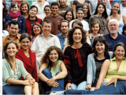
Have a good time at the Sommerhochschule

The intercultural dimension provided by the summer program's internationally diverse student population has become one of the