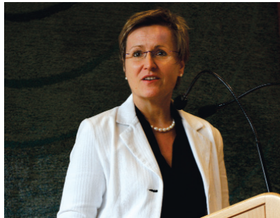
Opening Ceremony 2010