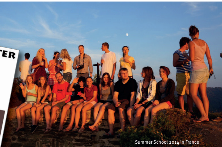
Summer School 2014 in France