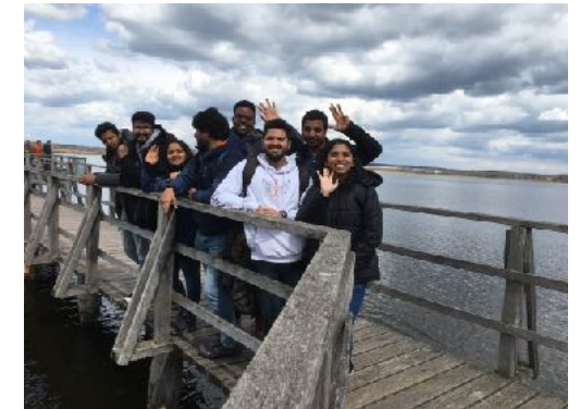
Bad Buchau 15.04