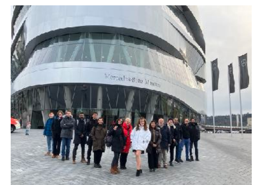
MB Museum 09.12