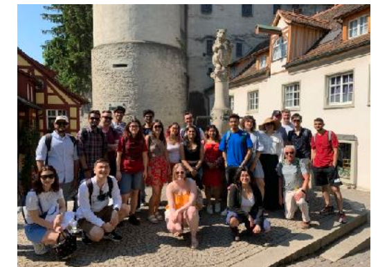
Konstanz 2 10.06