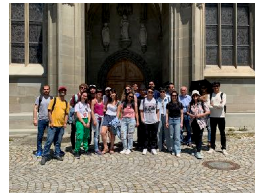
Konstanz 1 03.06