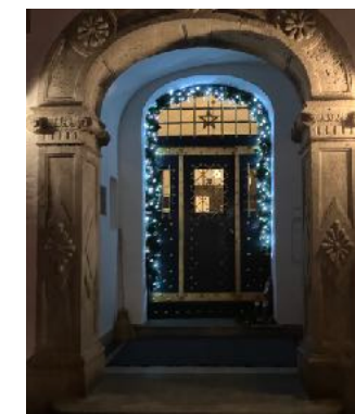
Christmas Party 07.12