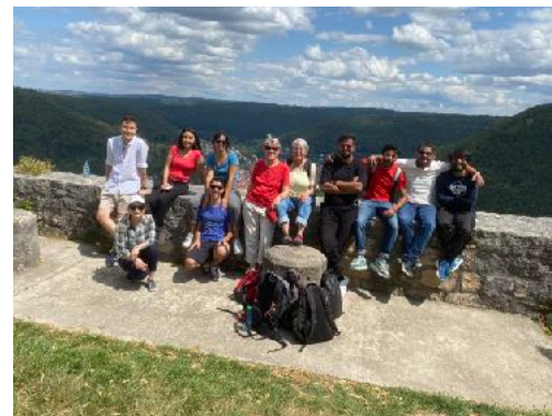
Bad Urach 22.07