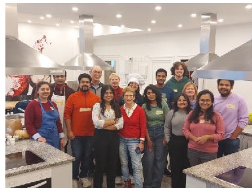
Cooking Event 11.11