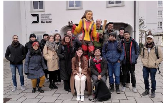
Bad Saulgau 18.02