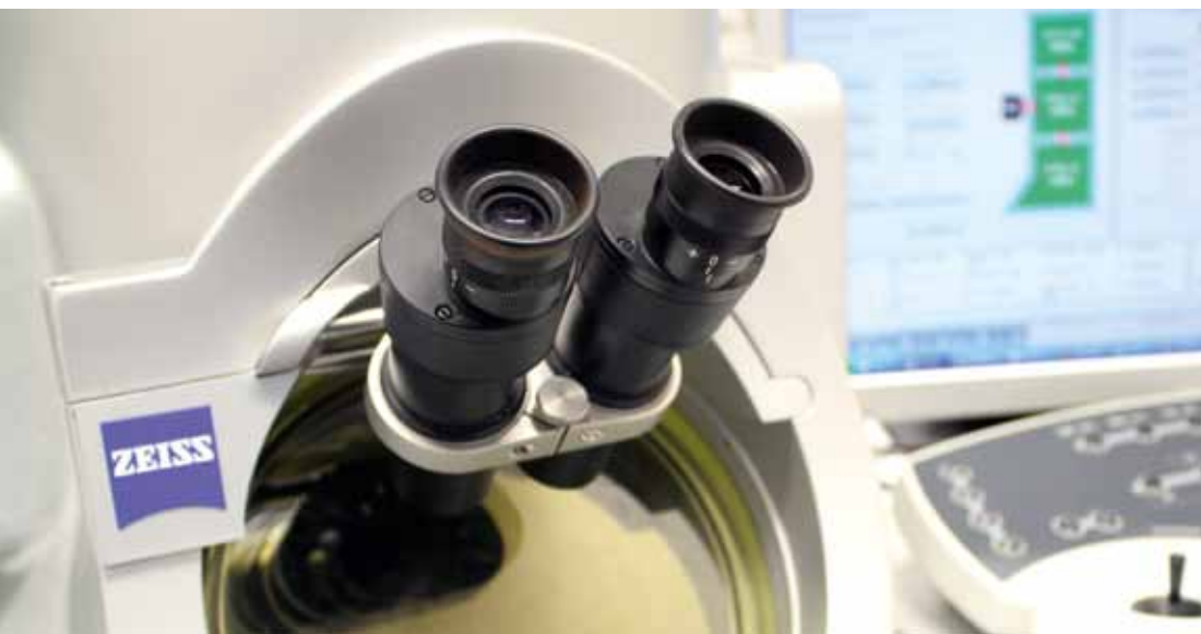
A microscope is being developed within the framework of the SALVE project that will increase resolution at low acceleration voltage – the microscope will essentially have some additional, stronger “glasses”.

The University of Ulm is backing low-voltage transmission electron microscopy – a new trend in electron microscopy with applications for battery research – the roots are in “Science City” Ulm